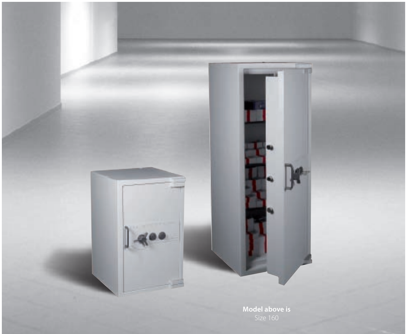
Model above is Size 160